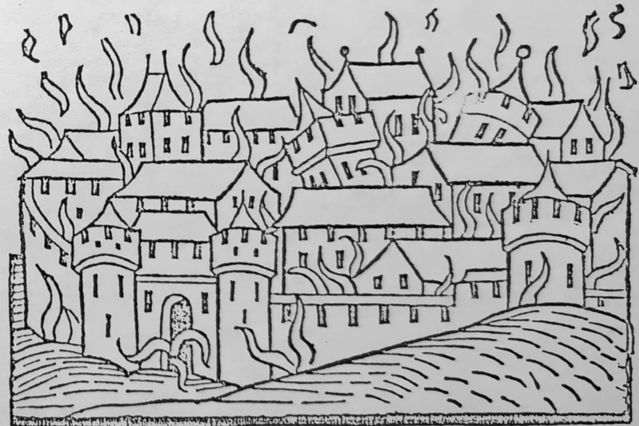
Destruction of Babylon. From Dover's Middle Ages Coloring Book.