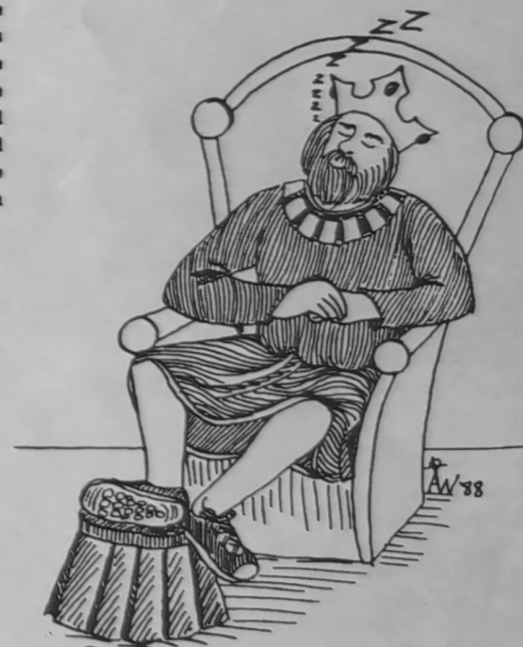
Kingly Virtues, #4: Benevolent and Serene

Contessa Miriam c/o Miriam Levin 1009 North Woodlawn Kirkwood, MO 63122-2803