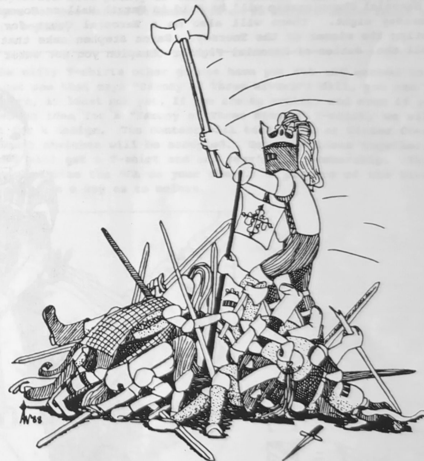
Kingly Virtues, #2: A Noble and Wise Leader