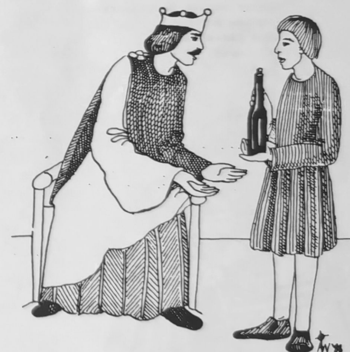
Kingly Virtues, #3: Gracious and Grateful