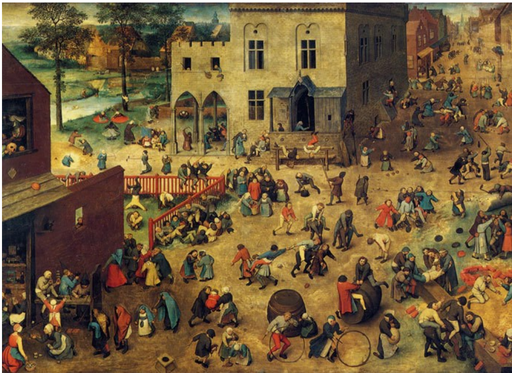
Pieter Bruegel the Elder's "Children's Games" 1560