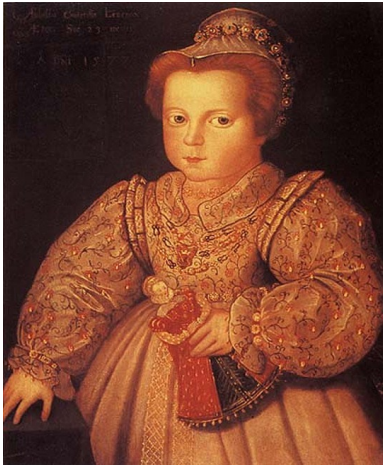
Arabella Stewart with her doll, 1580