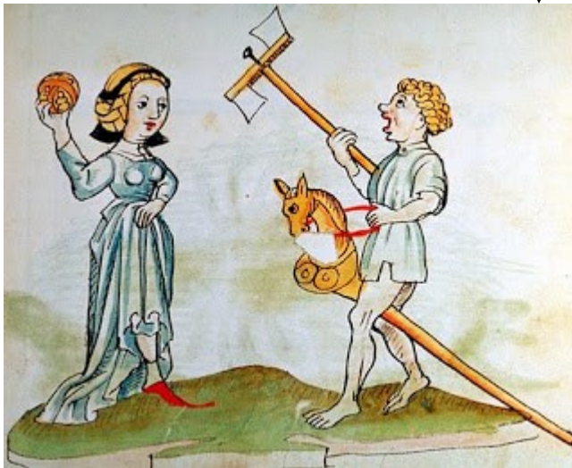
A girl with a ball, and a boy on a hobby horse. 1480's