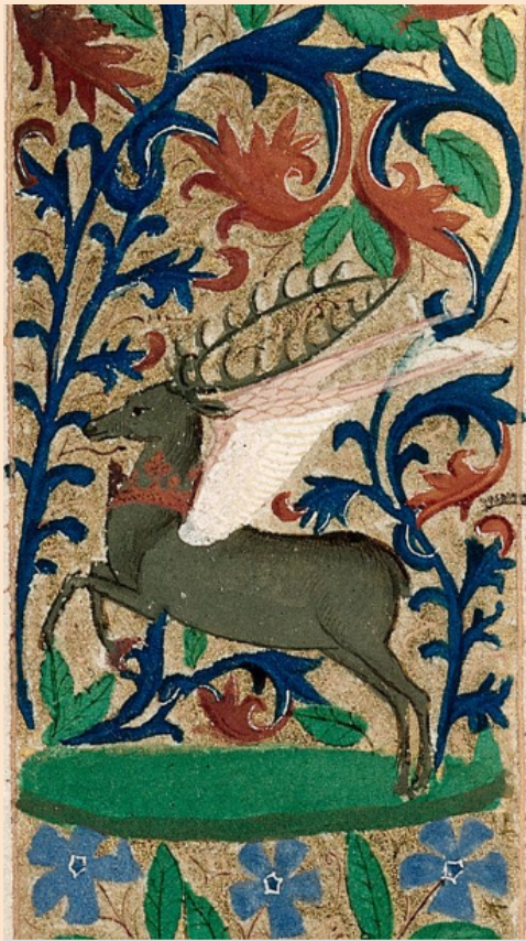
Winged deer with forget-me-nots, from Jean Froissart, Chroniques, Netherlands (Bruges), c. 1470-1472